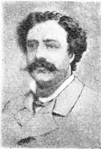
EDMONDO DE AMICIS